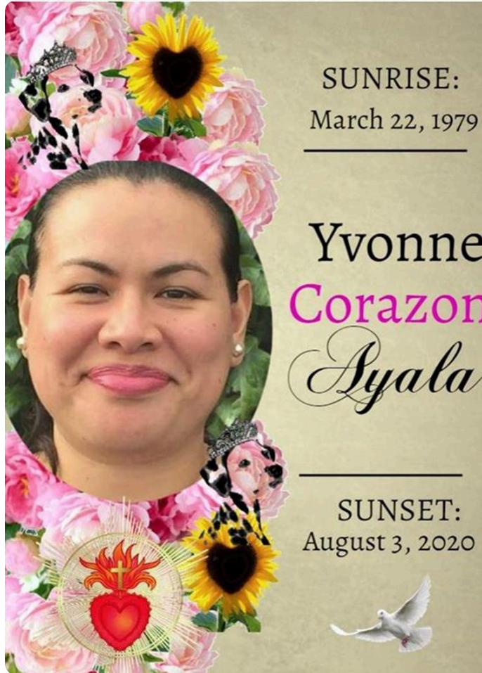
An update - including some of the things that she loved